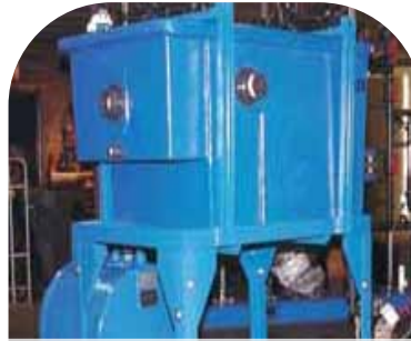
Optional elevated stand discharges oil directly into a reservoir