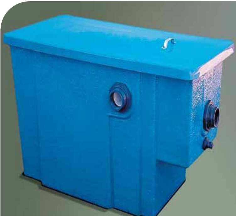
Durable, leak-proof, one-piece, corrosion resistant fiberglass construction